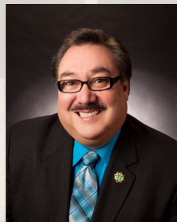
Kim Jew Photography Studio